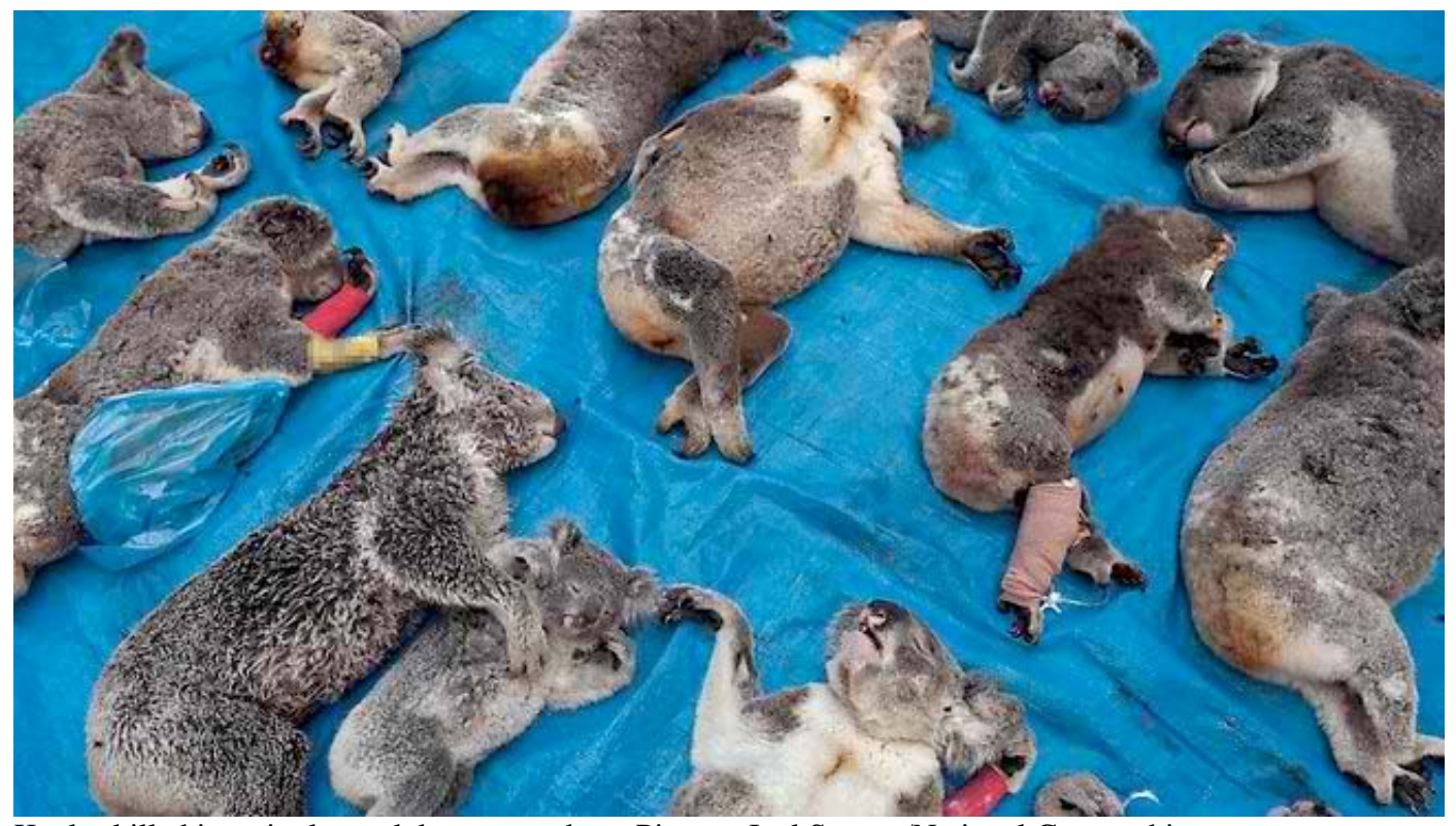
Koalas killed in a single week by cars or dogs.